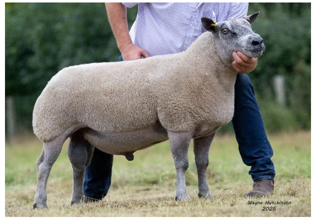
AINTREE Zane, 2,000gns